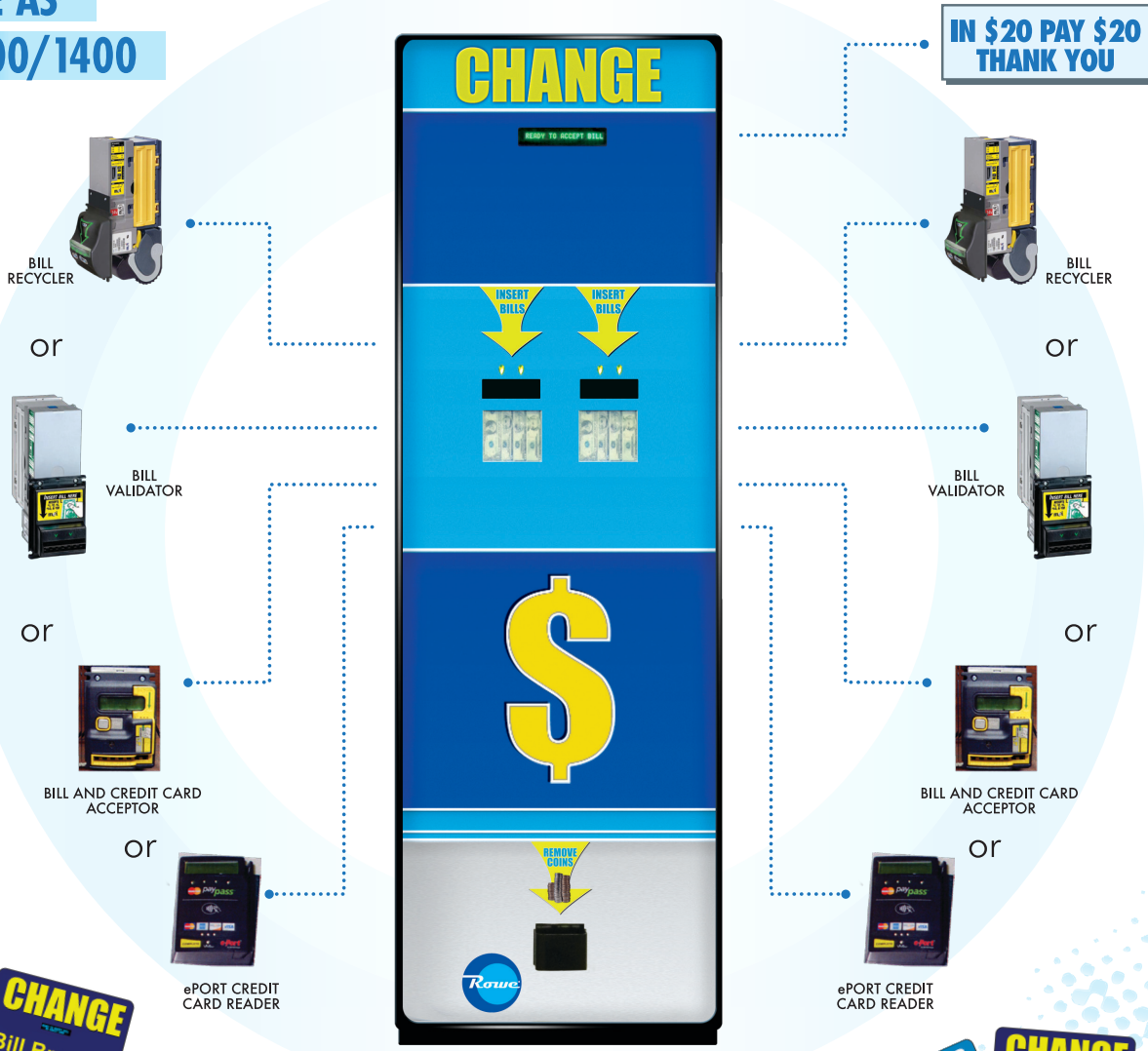
ROWE 400 REAR LOAD