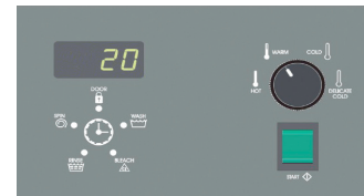
Galaxy 200 (G200)