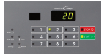
Galaxy 400 (G400)

Managers with the Galaxy 400 control can easily program and retrieve operations data about their machines through a PDA or laptop PC. Simple access to data and easy programming helps save time and ensures proper wash programs are being followed.