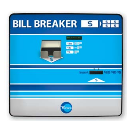
500RL-2 (shown), 500RL-1